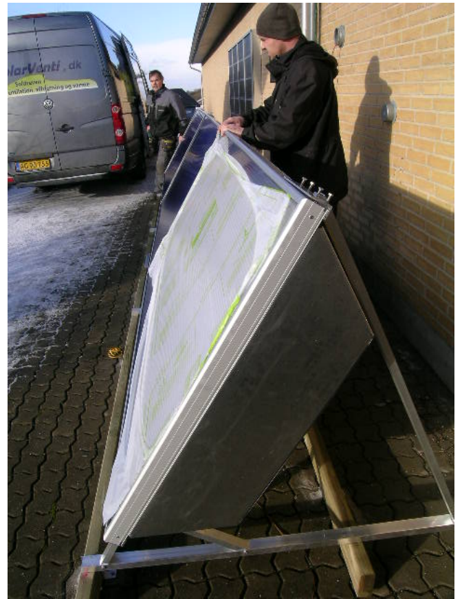
Rubber band between the elements.