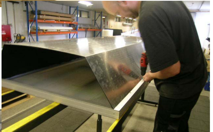
Assembling of the parts